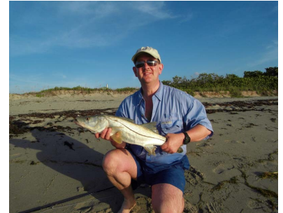
Snook off the Beach, Dania, FL.